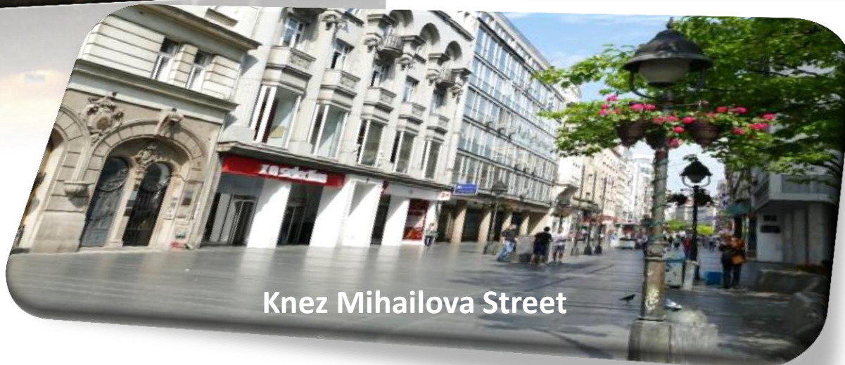
Knez Mihailova Street