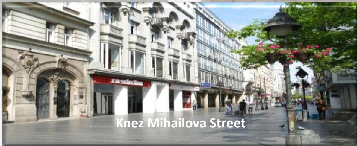
Knez Mihailova Street